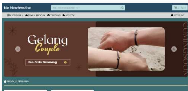
Me Merchandise E-Commerce