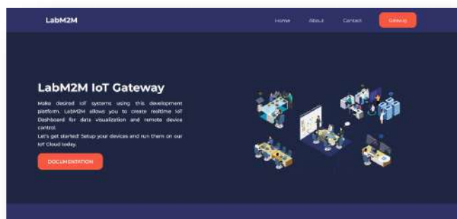
Lab Machine to Machine (LabM2M) IoT Gateway