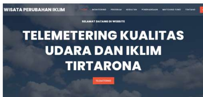
Website Monitoring Cuaca dan Kualitas Udara