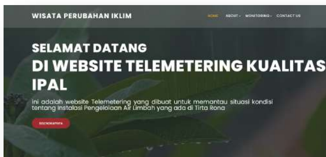
Website Monitoring Kualitas IPAL